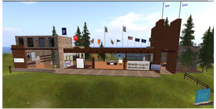
ISTE Island is a place where educators get together—A great place to start your Second Life journey.