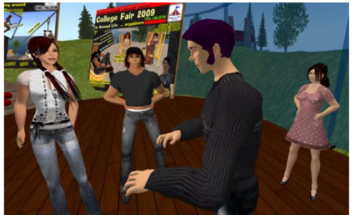
Communication in Second Life is through chat in the open or in groups, IM (private chat), or voice in the open or in groups.